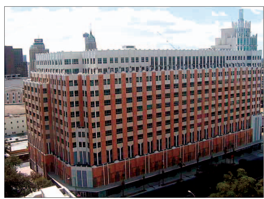
The Vistana - San Antonio, TX

Series 526, 527 Sliders; 550, 750 Fixed; all with with Finned Receptor Systems Also Series 1401 and 1421 Terrace Doors Light Green and Light Gray powder coated finishes