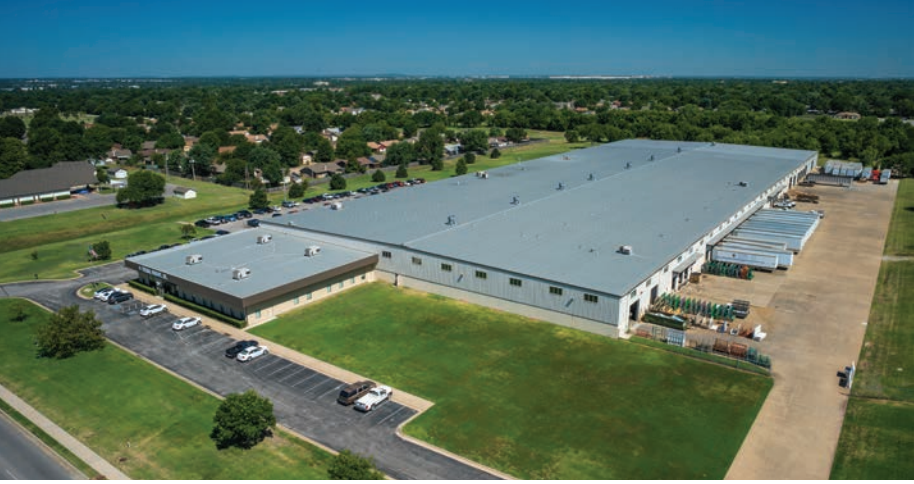
Corporate headquarters, manufacturing plant and showroom in Tulsa, Oklahoma

In addition to our commitment to testing and upgrading existing products, we continue to design new products to meet the fenestration needs of the residential, commercial and heavy commercial markets.