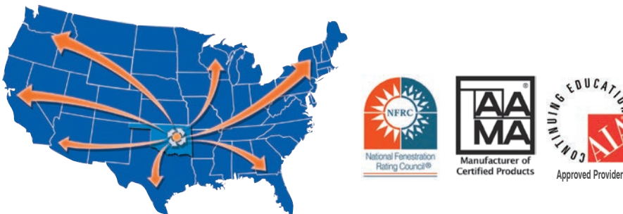
Our central location allows us to ship economically throughout the U.S.A.